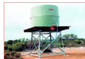
Tank on a stand