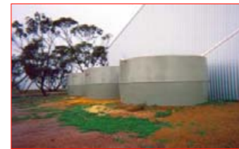
Three tanks joined together for water storage