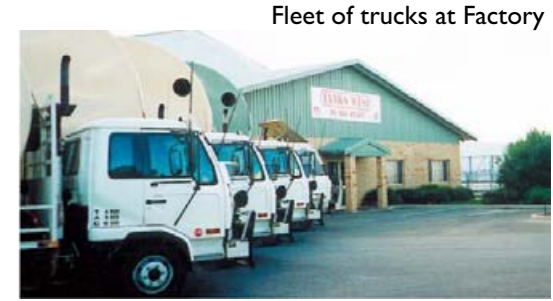
Fleet of trucks at Factory